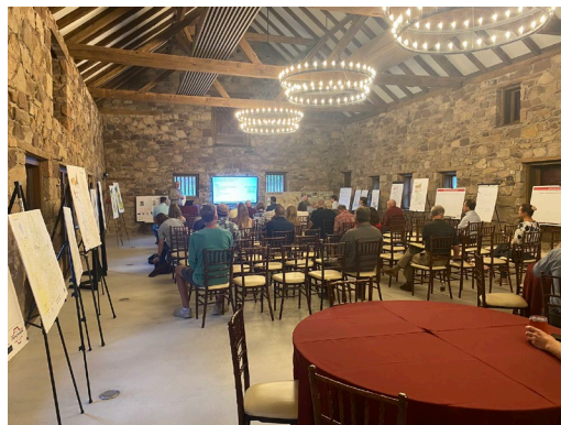
Warwick Region Comprehensive Plan Update